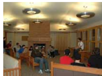
Gateway Heights Lounge