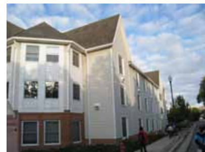
Chapel Glen Exterior