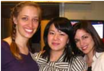
The tremendous trio