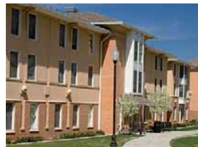
Sage Point Exterior