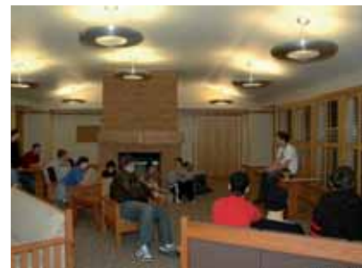
Gateway Heights Lounge